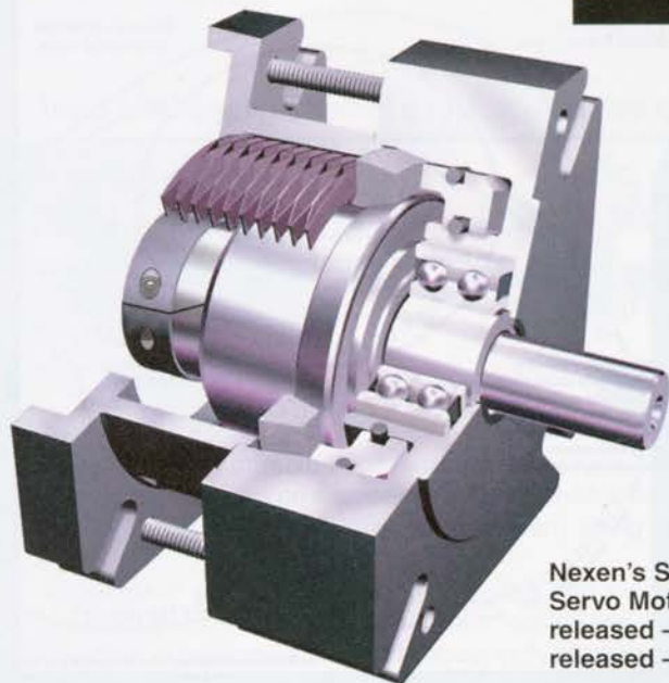
Nexen's Spring-Engaged Eclipse Servo Motor Brake features an air-released — rather than electrically released — design.

In the world of motion control and power transmission, control is the key design objective. Put simply, stopping a load in a predictable and controlled manner is at least as important as the motion itself, especially when it comes to the health and safety of machinery and operators. To find out what's new in the world of brake design, we asked a few manufacturers what they are seeing as overall business trends and if they've developed any innovative products lately.