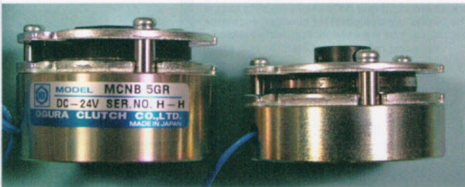
Ogura Industrial Corp.'s Thin Profile MCNB Brake employs a higher coefficient of friction material and more efficient coil flux path to reduce brake size.